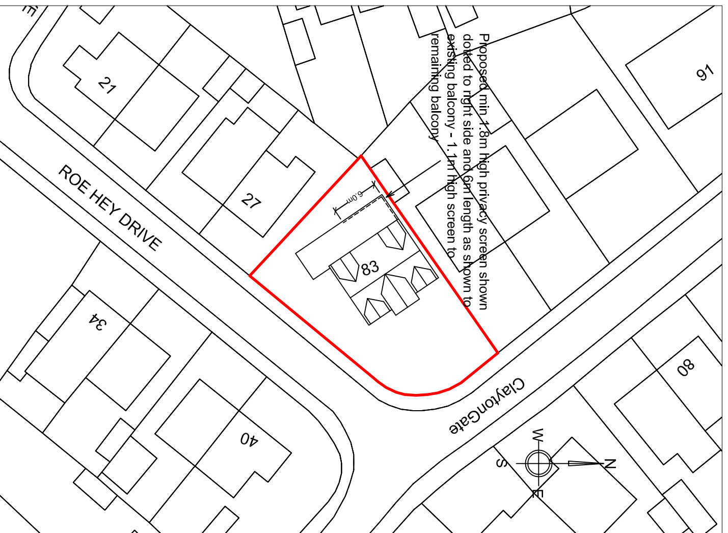
PROPOSED 1:500 LOCATION MAP